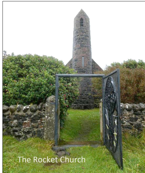
The Rocket Church