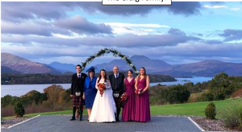
The Craig Family