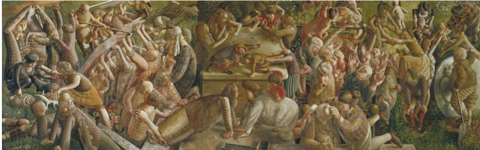
Cover Picture: The Resurrection: Port Glasgow by Stanley Spencer

All Saints is a registered charity in Scotland SCO00555