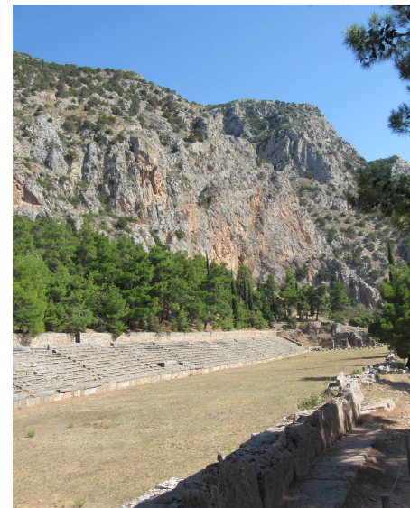
Stadium at Delphi below Parnassus

One of the things which made it even more interesting was his own description of what he saw and the comparison he made with his last visit to Greece in 1967. It is a strange notion that sites which are over 2,500 years old could change very much in only 50 years, but the slides taken in 1967 and 2017, placed side by side on the screen, showed just how much they had.